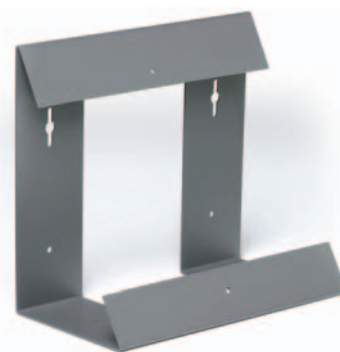
M7140 Angled Wall Mount Bracket

Linux® is the registered trademark of Linus Torvalds in the U.S. and other countries.