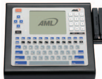
M7140 with Factory Installed MSR/Slot Reader